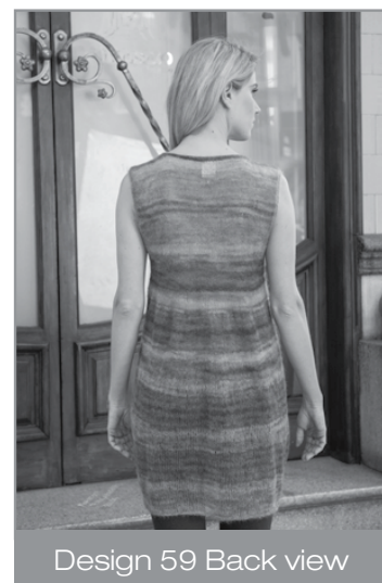
Design 59 Back view

Finishing: Pin piece to measurements and block. Sew shoulder seams. With longer size 3.5 mm circular needle, pick up and k 120 sts around neck edge. Join for working in rnds and work stockinette in rnds for 3 rnds. Bind off all sts. With shorter size 3.5 mm circular needle, pick up and k 90 (96) sts around left armhole edge. Join for working in rnds and work stockinette in rnds for 2 rnds. Bind off all sts. Repeat for right armhole edge.